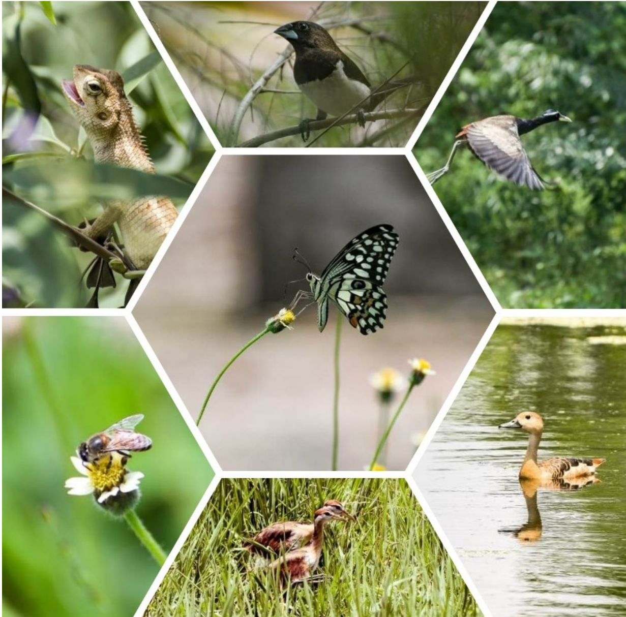
Bio-diversity in our College