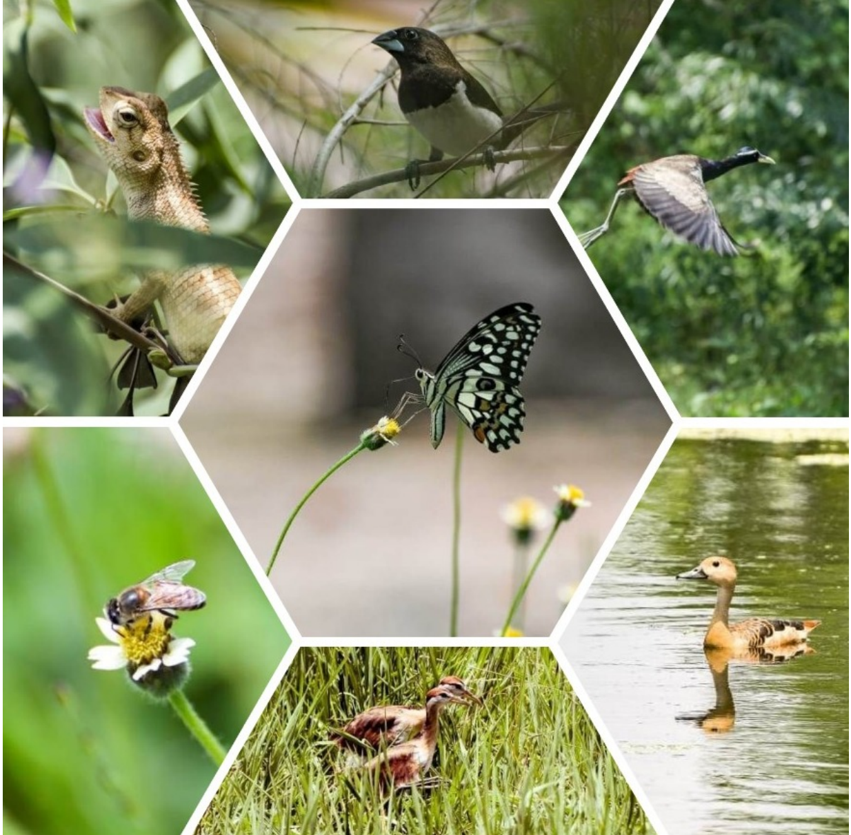
Bio-diversity in our College